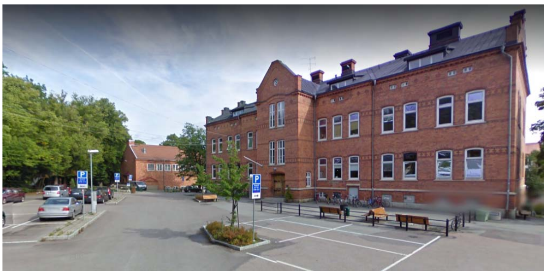
Västerås folkhögskola main building, Kristinagatan 12 (next to the city centre)

Last edit: 27.07.2018 - some changes may still happen